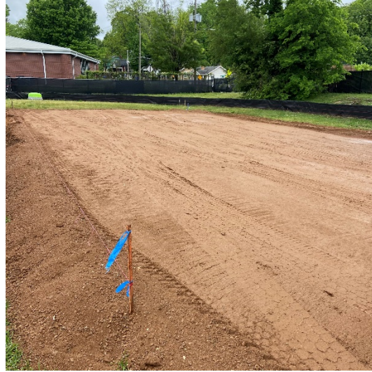
Building Pad Subbase