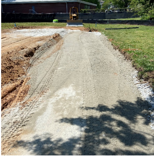
Building Pad Undercutting