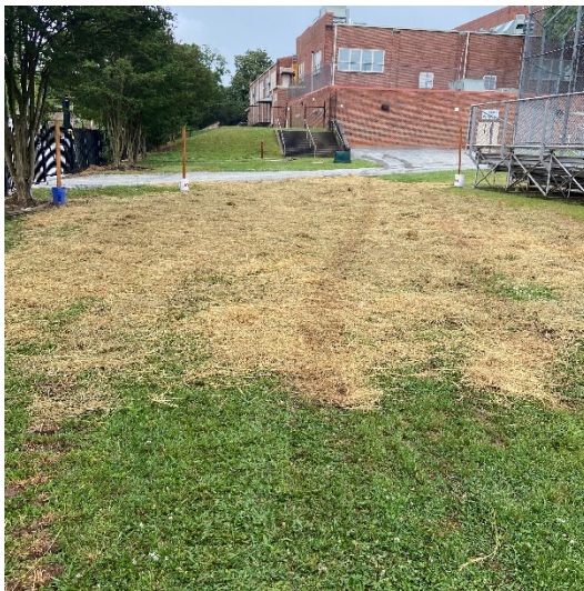
Crane Pad Cleanup and Re-seed